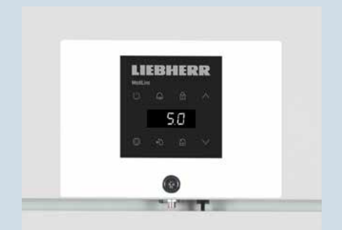
Precise temperature control. Vaccines and refrigerated medicines can be securely stored between +2 °C and +8 °C.

Liebherr vaccine and pharmacy refrigerators are Quality Care Pharmacy Program compliant and purpose-built with high quality materials to meet the stringent standards needed by your pharmacy. Trust in the superior performance and reliability of Liebherr to store your valuable vaccine and refrigerated medicines safely and effectively at the precise temperature-controlled conditions.